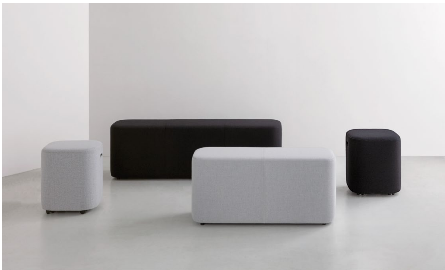
LOAF _pouf / bench